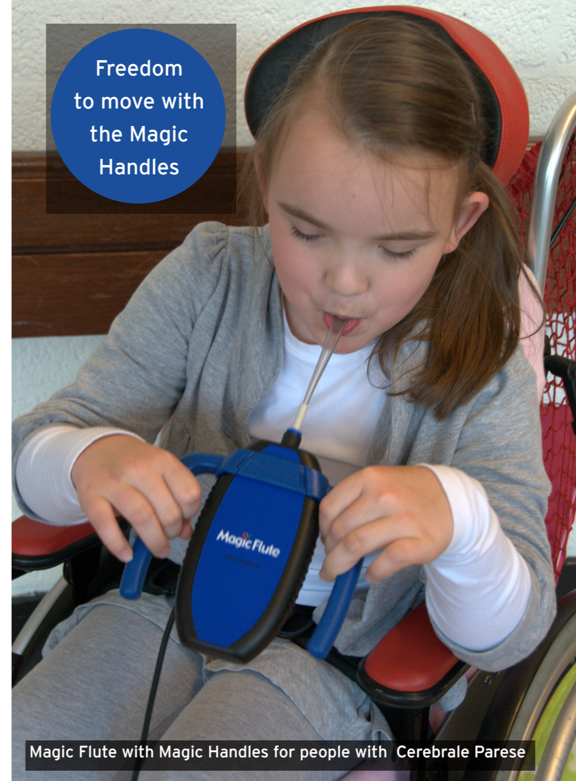
Magic Flute with Magic Handles for people with Cerebrale Parese

“ And who knows maybe the next rock star will be a Magic Flutist! ”